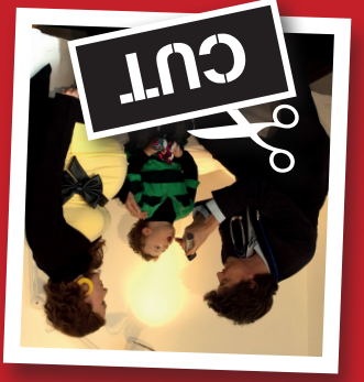
GP Super Clinics & GP hotline