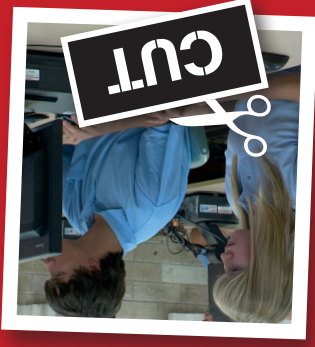
Computers in schools