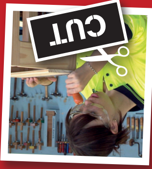
Trades Training Centres