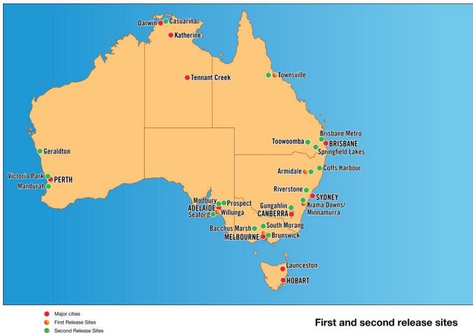
CHART: NBN CO FIRST AND SECOND RELEASE LOCATIONS

NBN Co has also announced 19 second release locations. These locations comprise 14 new locations, and five sites adjacent to the existing first release sites. Construction in the second release locations is scheduled for the second quarter of 2011.